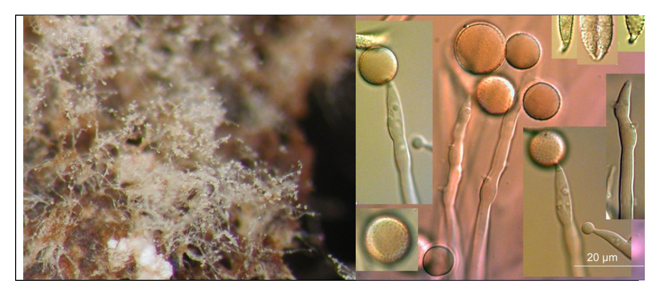
Fungus #3 – Rhinotrichella globulifera

This is another asexual fungus growing on dead portions of the Hypomyces (and in so in this case is a hyperhyperparasite) and it has distinctive conidia.