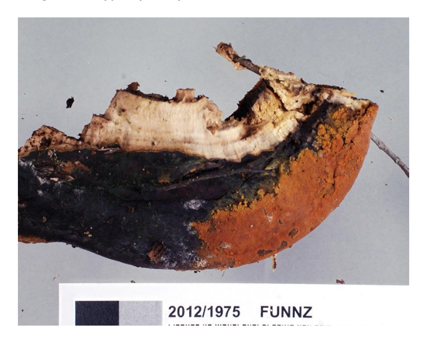
Fungus #2 – Hypomyces c.f. aurantius

This is a parasitic ascomycete in the genus Hypomyces growing on the dead bracket (a hyperparasite). Some Hypomyces species are parasites of different kinds of fungi and come in a range of colours. An equally bright orange one ( H. lactifluorum ) infects Russula and Lactarius and is considered an edible delicacy under the name Lobster Mushroom. The usual one on polypore fungi, with this bright orange colour, which turn purple with Potassium hydroxide solution is H. aurantiacus . Like many ascomycetes Hypomyces have a distinctive asexual anamorph states. Hypomyces aurantiacus should have a Cladobotryum anamorph which is often present and easy to recognise microscopically, with broadly ellipsoid 1-septate conidia. In this case I couldn't find it. In fact this Hypomyces was rather obviously associated with a fluffy fungus that microscopically looks like a Verticillium .