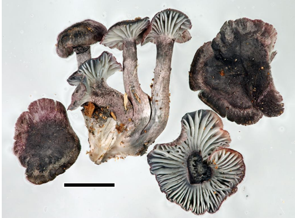
Panus sp. 'Ohakune (PDD80757)' J.A. Cooper ined. Collection PDD87665